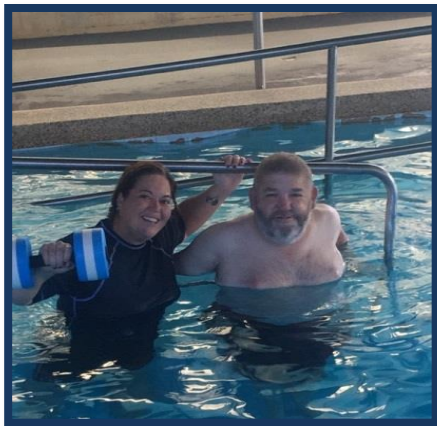
Pool Work Out

Everyone really looks forward to the Disco and great preparation goes into the planning of the outfits for each theme. The Discos are held monthly and are a great social event with everyone catching